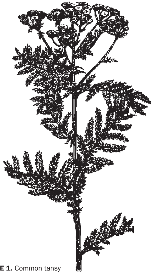
FIGURE 1. Common tansy

Common tansy is often confused with tansy ragwort ( senecio jacobea ), a poisonous pasture weed and statewide noxious weed. Tansy ragwort can be distinguished from common tansy by its ray flowers (petals), absence of sharp toothed leaves and the long fringe of soft white hairs found on the seeds (Figure 3).