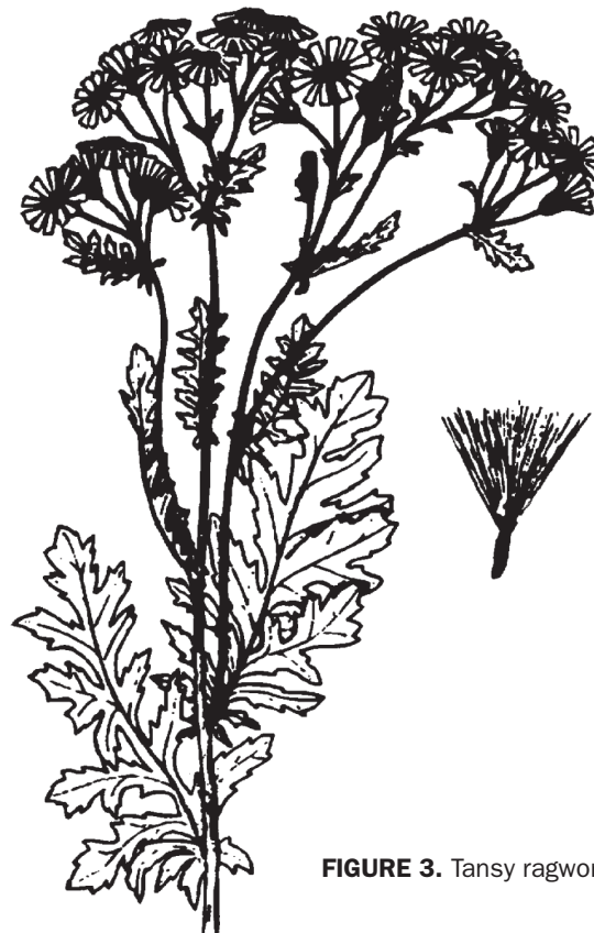
FIGURE 3. Tansy ragwort

There has been limited research on control of common tansy. As with all weeds, prevention of the establishment and spread of infestations is the most cost effective management tool. This can be achieved by limiting disturbance of weed-free lands. Grazing should be limited to less than 60 percent defoliation of desirable grasses. This will limit opportunities for common